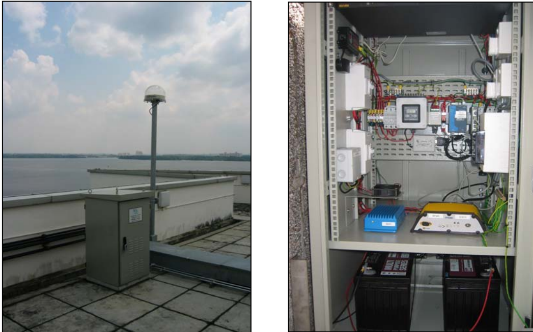
Figure 2: Typical set-up of a GPS reference station in SiReNT

There are cooling fans in the equipment cabinet which is controlled by a thermal switch. The switch will be activated at 40°C and deactivated at 30°C. In the event of an AC power outage, the system will run on 2 batteries (100Ah) for approximately 65 hours. The temperature and power at the equipment cabinets are centrally monitored. In the event of abnormal condition, alert will be generated by the DCC and send via SMS to system administrator. The coordinates of the reference stations will also be monitored by the DCC. The monitoring processes designed to ensure the high reliability of the system.